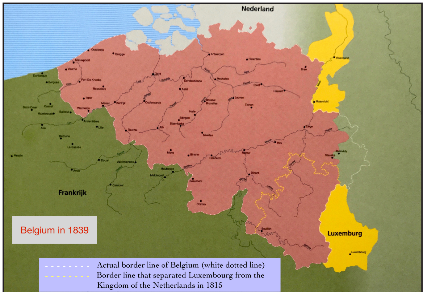
Fig. 2 : The map of Belgium as in 1839