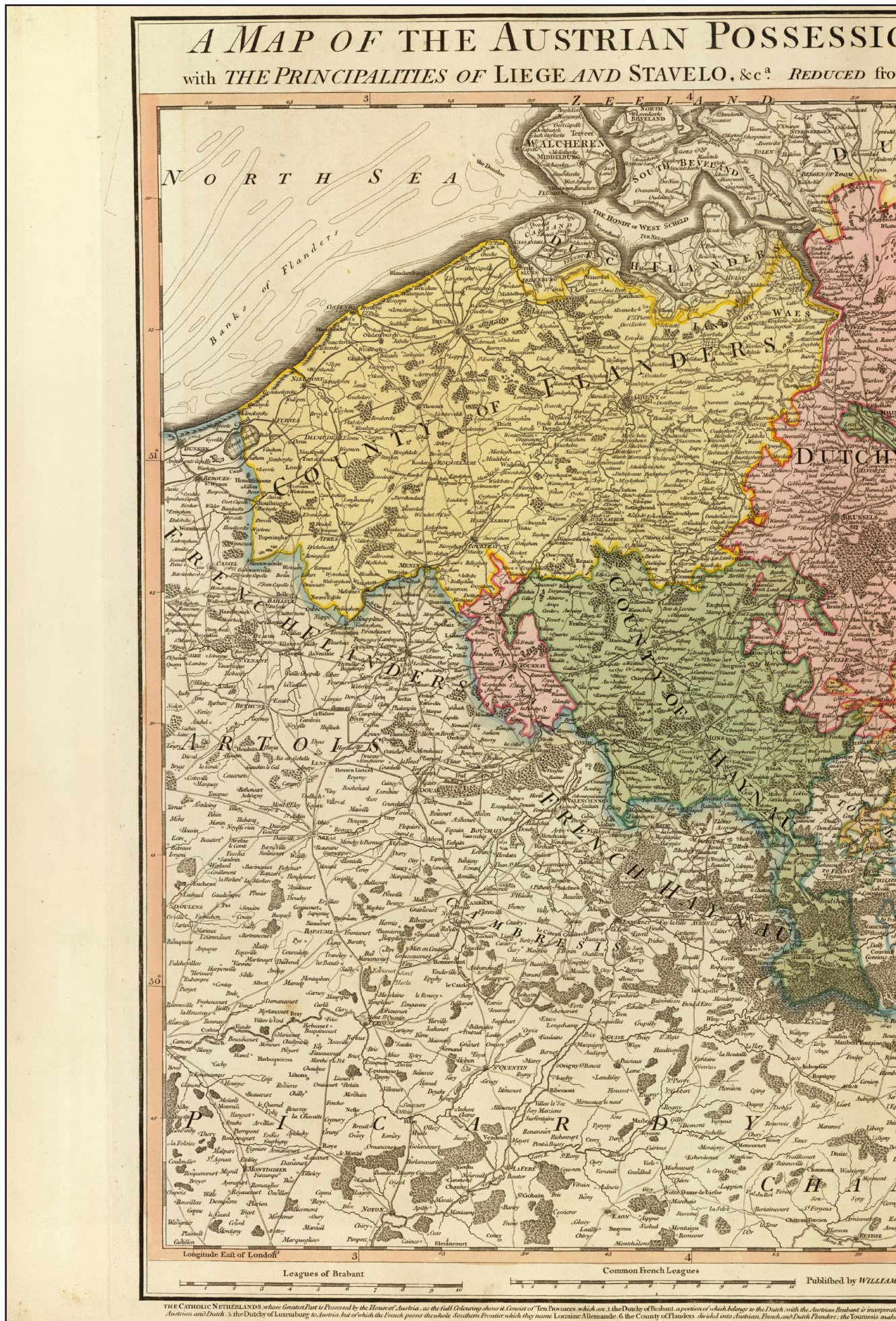
Fig. 3 : A map of the Austrian possessions in the Netherlands or Low Countries, .... published by William Faden , Geographer